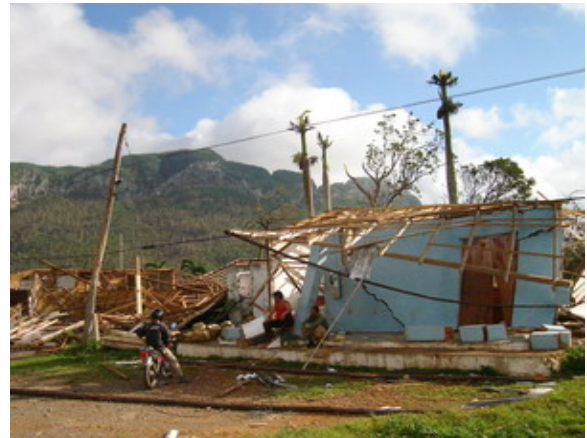
http://www.guerrillero.co.cu/018020/0815.htm La Palma