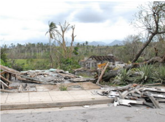
http://www.guerrillero.co.cu/018020/0813.htm Bahía Honda