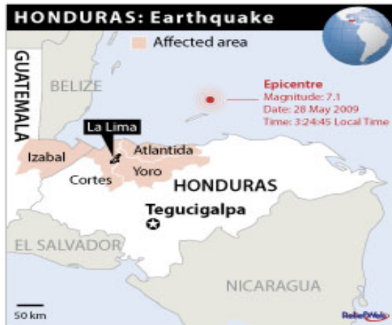
28 May 2009 - Earthquake off Honduras coast caused 1 death in La Lima district, several houses damaged in Honduras and Guatemala.

Reference: Government of Guatemala, Boletín Informativo No 255 - CONRED evalúa daños a nivel nacional, 28 May 2009. The boundaries and names shown and the designations used on this map do not imply official endorsement or acceptance by the United Nations. Map created on 28 May 2009 - www.reliefweb.int