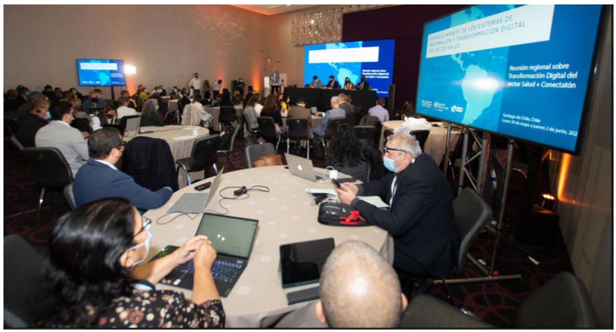
In Santiago, Chile, in May 2022, PAHO supported an international conference ("Connectathon") focused on helping Latin American and Caribbean countries prepare for use of telehealth platforms to provide virtual medical consultations for patients unable to receive in-person care.

Acceleration of telemedicine during COVID-19 pandemic gave rise to the US Governmentsupported program