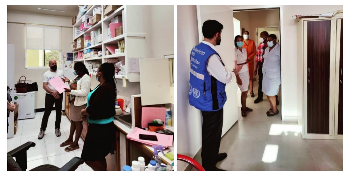
Earlier this year, PAHO visited Dominica to assess the country's readiness for use of telehealth and to identify clinics and hospitals that could become sites for pilot programs.

The procurement of equipment for Suriname is part of PAHO's 2022 efforts to expand services for people with noncommunicable diseases (NCDs) through increased use of telehealth in Latin America and the Caribbean. NCDs are the leading cause of death and disability in the region. The telehealth project has used the USG financial contribution to procure digital equipment for ministries of health and develop software that will allow them to create their own telehealth platforms.