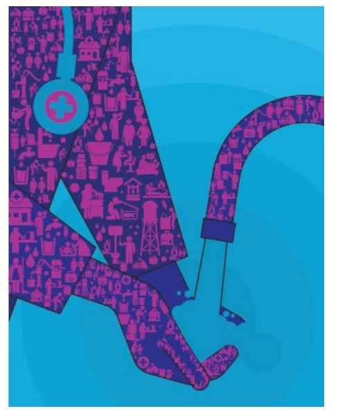
Fundamentals first: Universal water, sanitation and hygiene services in health care facilities for safe, quality care for all

Global progress report coming December 2020!