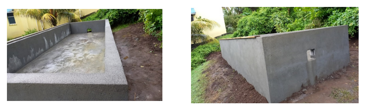
Figures 1 and 2: Concrete bases for water tanks at Biabou Clinic