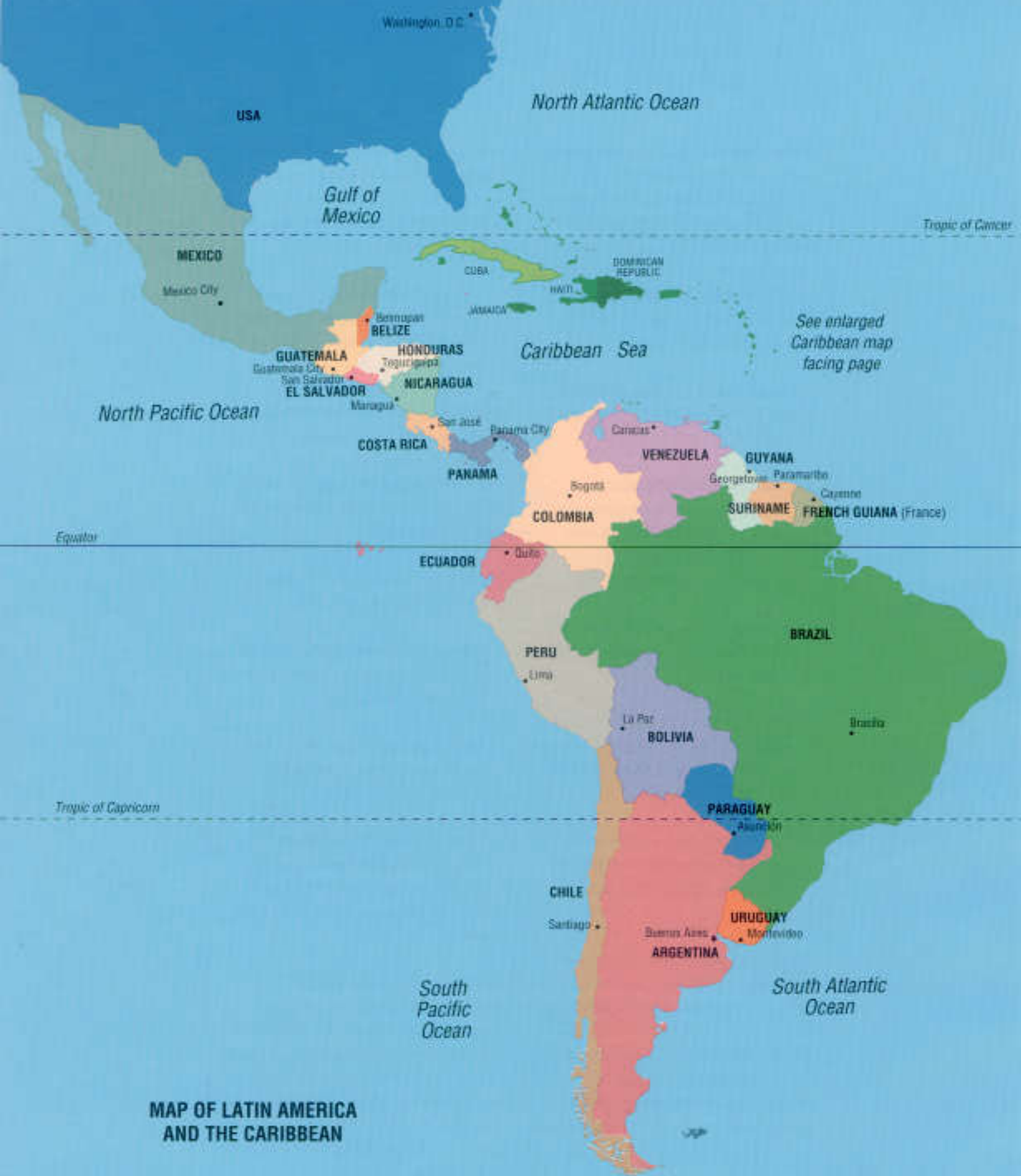
MAP OF LATIN AMERICA AND THE CARIBBEAN