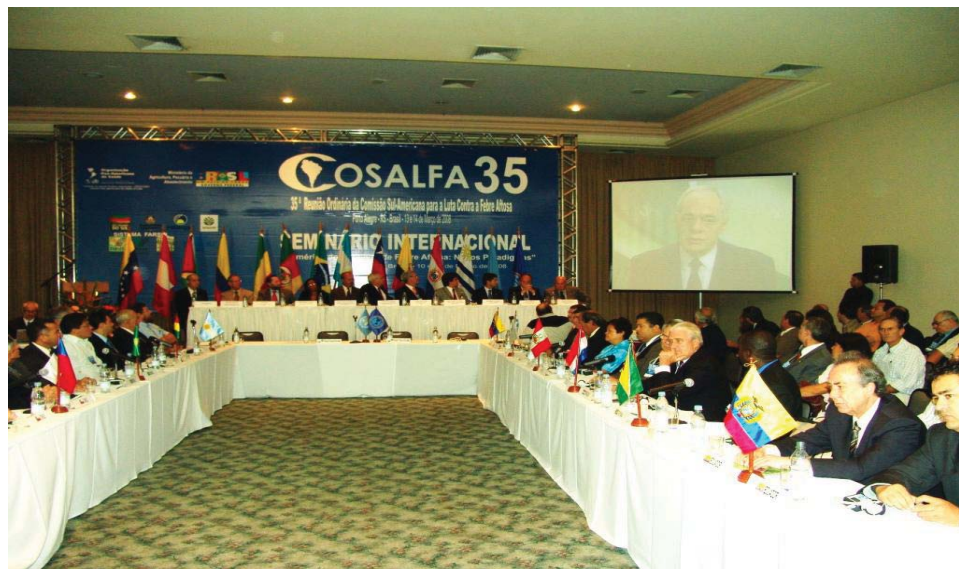
The COSALFA Meeting assembled representatives of eleven South American countries to discuss the situation of foot-and-mouth disease

During March 11th and 12th, the pre-COSALFA international seminar was held and the subject was "South America Free of Foot-and-Mouth Disease: New Paradigms". There were discussions on how to reach the FMD-free status at the present time, work methodologies for eradication goals and how to maintain them after 2009. The Seminar reinforced the request made to the countries for greater efforts to comply with the objectives of the Hemispheric Plan for Eradication of Foot-and-Mouth Disease – PHEFA, and recommended the development of public and private sector projects in health activities for eradication programs.