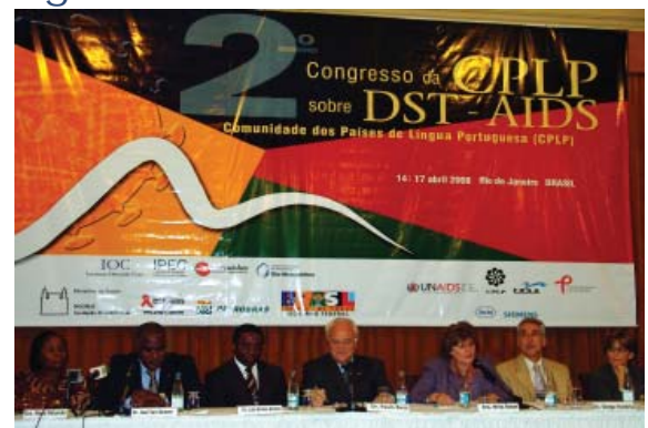
The Congress held in March in Rio de Janeiro assembled representatives from Portuguese-speaking countries

The second edition of the Congress of the Community of Portuguese-speaking Countries (CPLP, in Portuguese) on STD/AIDS was promoted by the Oswaldo Cruz Foundation (FIOCRUZ) in order to discuss clinical, epidemiologic and social features of these diseases as well as the field action of technicians in diagnosis and the link to antiretroviral drugs.