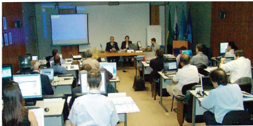
The focus was to test and adapt the model to the South American productive-epidemiologic reality and to propose pilot projects in accordance with the characteristics of each country

From March 31st and April 4th, PANAFTOSA-PAHO/WHO offered joint training with the Canadian Food Inspection Agency (CFIA) on the North American Animal Disease Spread Model (NAADSM).