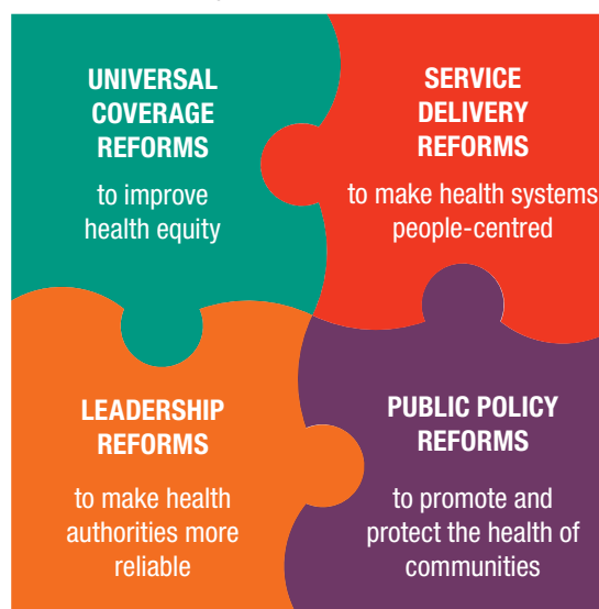
Figure 1 The PHC reforms necessary to refocus health systems towards health for all

than they were 30 years ago, but large population groups have been left behind. In some places, war and civil strife have destroyed infrastructure, in others, unregulated commercialization has made services available, but not necessarily those that are needed. Supply gaps are still a reality in many countries, making extension of their service networks a priority concern, as was the case 30 years ago.