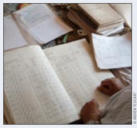
Above: The office recording system before...