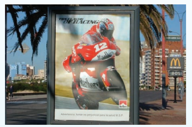
Tobacco advertisement showing sponsorship of racing team.