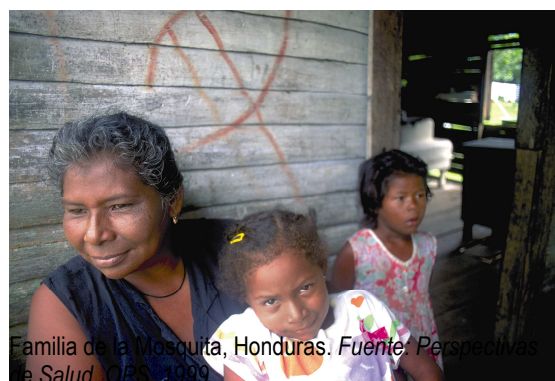
Familia de la Moscurta, Honduras.

To this morbidity that registers private data for each community diarrheal syndromes, intestinal parasitosis, `malnutrition`, and dermatopathies should be added. `Malnutrition` is a problem widespread between all the indigenous peoples of Honduras, 95% of the indigenous population less than 14 years suffers from `malnutrition`.