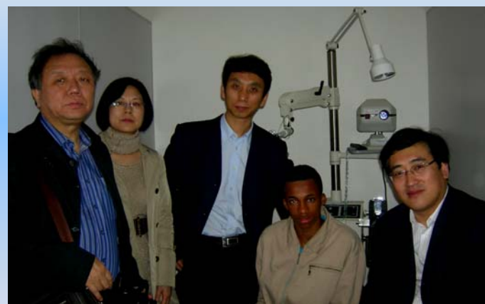
Sao Paulo, Brazil – Chinese delegation accompanying a CSR patient/case