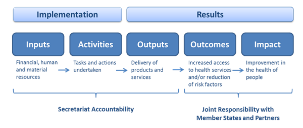
Figure 1. The WHO results chain

The revised results chain has the following elements: