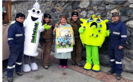
Chile celebrates VWA.