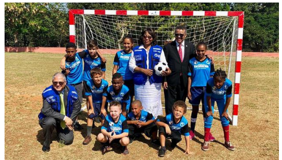
VWA 2018 launch in Havana, Cuba.