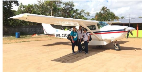
Vaccinators in Honduras heading to vaccinate populations in Moskitia and Garifuna for VWA.