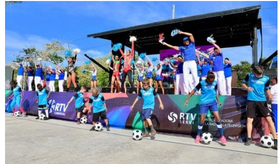
VWA 2018 launch in Havana, Cuba.

During the opening ceremony, the Cuban Deputy Health Minister, Jose Angel Portal Miranda, emphasized that in Cuba "vaccination is available to everyone, free of charge, and can be accessed from primary health care providers. As a result,