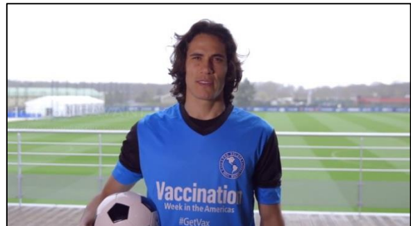
Screenshot of VWA 2018 PSA with Edinson Cavani

Uruguayan football star Edinson Cavani joined the Vaccination Week in the Americas 2018 campaign. The striker for the Uruguayan national team and Ligue 1 club Paris Saint-Germain appears in a public service announcement (PSA) encouraging children, parents and the whole family to “make the best goal of their lives” and get vaccinated.