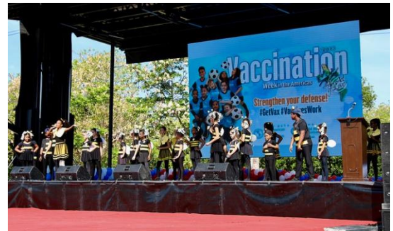
VWA 2018 launch in Havana, Cuba.