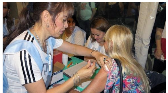
The Night of Vaccines, Córdoba, Argentina, April 2018.