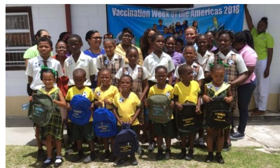
Guyana celebrates VWA.