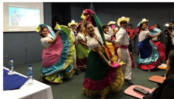
VWA is celebrated in Costa Rica.