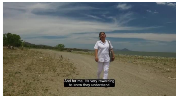
Still of “An act of love in the land of lakes and volcanoes, Nicaragua.”