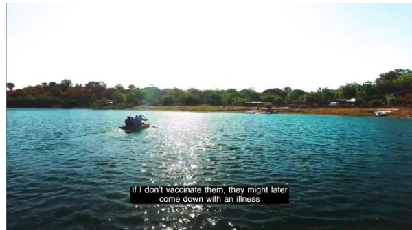
Still of “An act of love in the land of lakes and volcanoes, Nicaragua.”