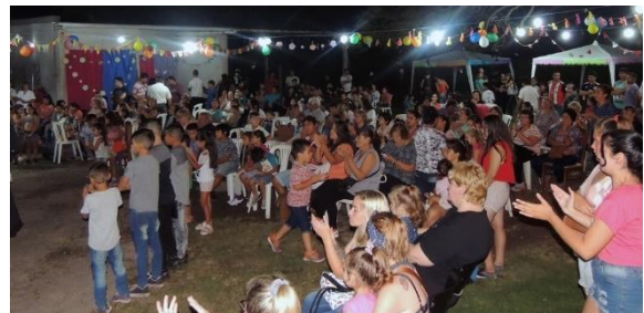
The Night of Vaccines, Córdoba, Argentina, April 2018.