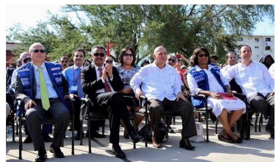
VWA 2018 launch in Havana, Cuba.