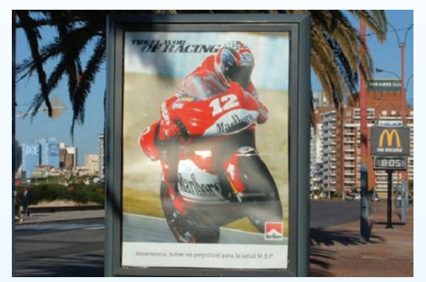
Tobacco advertisement showing sponsorship of racing team.