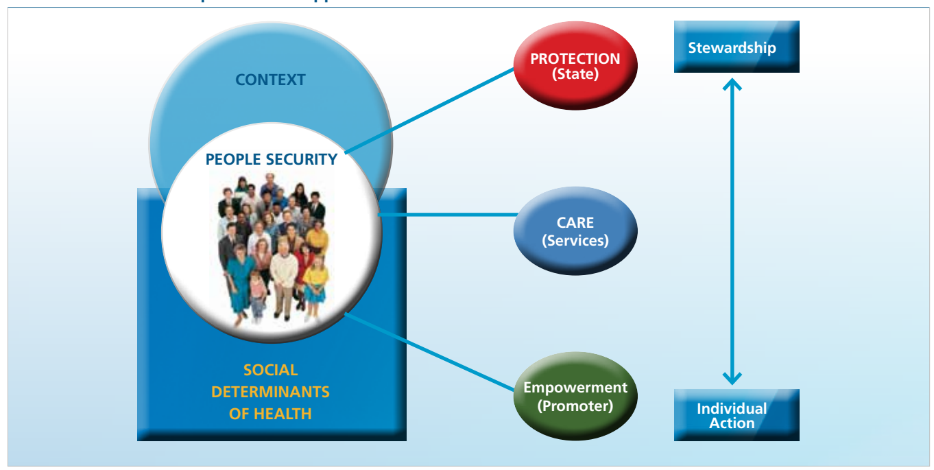
The Dual Protection/Empowerment Approach

fact, "illness, disability and avoidable death are 'critical pervasive threats' to human security." Health is defined here as not merely the absence of disease, but rather as "a state of complete physical, mental and social well-being." Health is both objective physical wellness and subjective psychosocial well-being and confidence vis-à-vis the future.