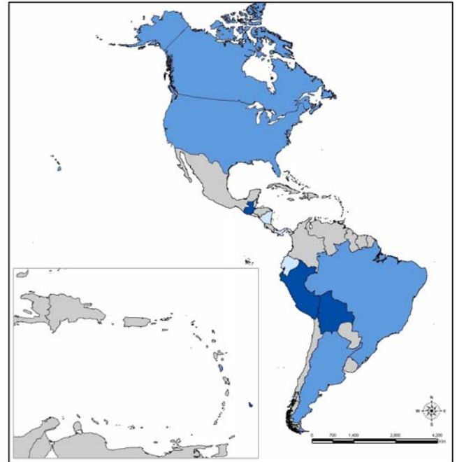
Map 2. Pandemic (H1N1) 2009, Trend of respiratory disease activity compared to the previous week. Americas Region. EW 11, 2010*.

Trend □ No information available □ Decreasing □ Unchanged ■ Increasing