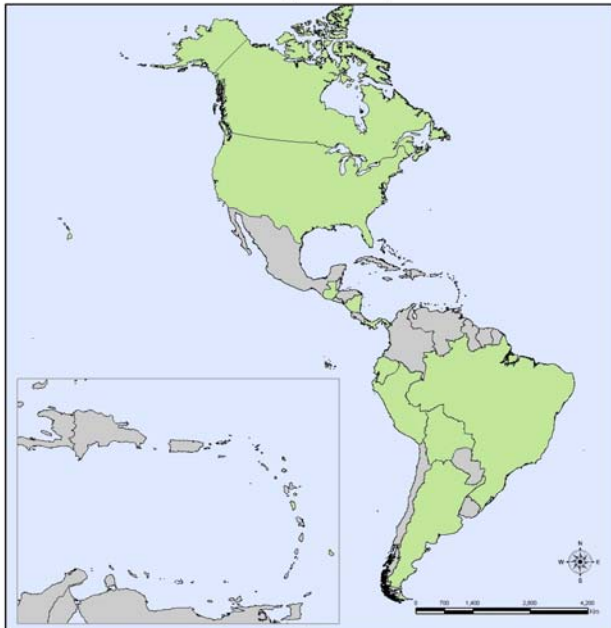
Map 3. Pandemic (H1N1) 2009, Intensity of Acute Respiratory Disease in the Population. Americas Region. EW 11, 2010*.

Intensity of acute respiratory disease □ No information available □ Low or moderate ■ High ■ Very high