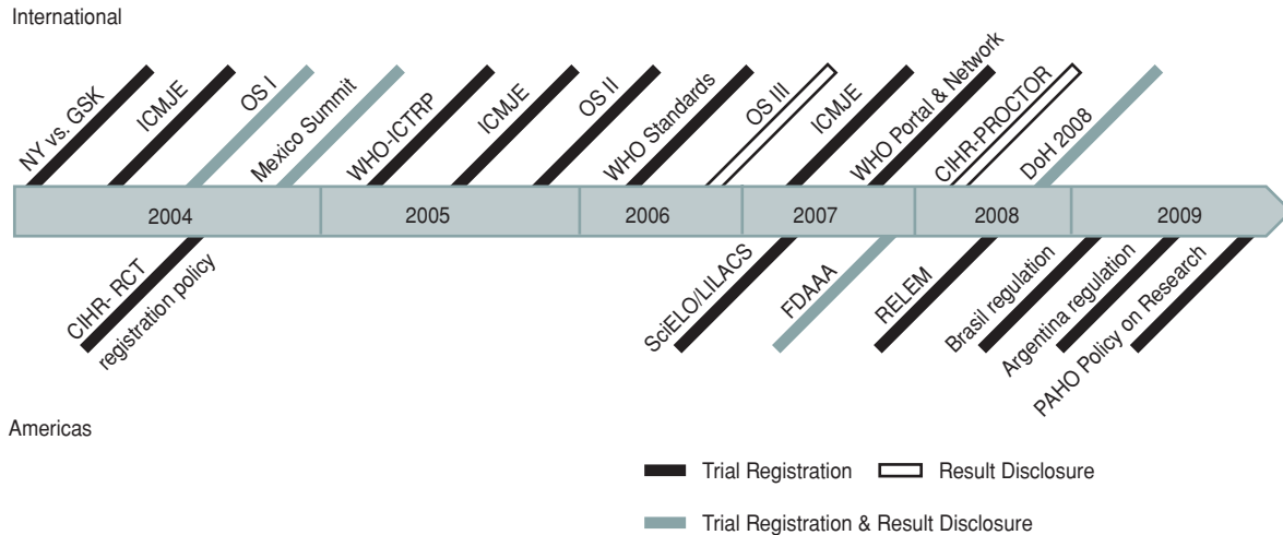
FIGURE 1. Timeline of trial registration and results disclosure initiatives at the international level and in the Americas

Note: International: NY vs GSK: The case of New York Attorney General against GlaxoSmithKline (17, 18); ICMJE: International Council of Medical Journal Editors (ICMJE) statement on trial registration 2004 (19); OS I: Ottawa Statement part one (20, 24); Mexico Summit: Mexico Global Forum and Ministerial Summit on Health Research (21); WHO-ICTRP: World Health Organization/International Clinical Trials Registry Platform (22); ICMJE: International Council of Medical Journal Editors statement 2005 (49); OS II: Ottawa Statement part 2 (23); WHO Standards: WHO international standards for trial registration (22); OS III: Ottawa statement part 3, results disclosure (24); ICMJE: ICMJE statement 2007 (23); WHO Portal & Network: WHO search portal and registry network (30); CIHR-PROCTOR: Canadian Institutes of Health Research—Public Release of Clinical Trials Outcomes and Results 2008 (58, 59); DoH 2008: Declaration of Helsinki (34, 35).