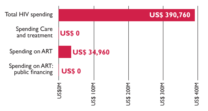
Figure 5 Annual spending on HIV, care and treatment, ARV treatment, and public spending on ARV

Note: The figure for total HIV spending is from 2009. The figure for ART spending, approximately US$34,960 for 2010, was added (personal communication with PAHO).