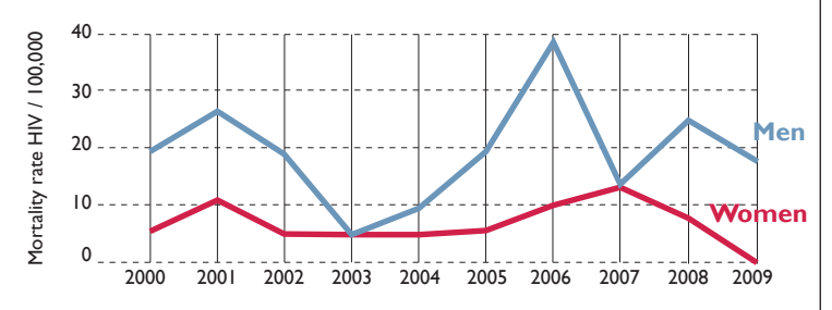
Figura 4 Standard mortality rate due to HIV by sex