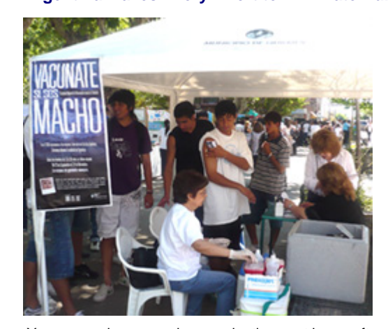
Young people approach a vaccination post in a craft fair. Quilmes / Argentina.

Argentina hit the ground running at the beginning of May with its complementary vaccination campaign targeting men aged 16-39 years to eliminate rubella and congenital rubella syndrome (CRS). The country achieved a coverage of 80.3% by the end of December 2008 with its campaign " If you're a man, get vaccinated, " and it is expected that with the intensification of complementary vaccination activities and surveillance the country will finally interrupt endemic circulation.