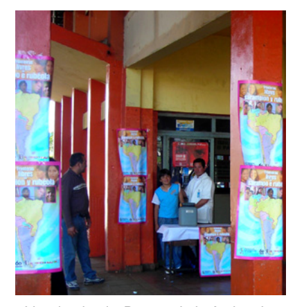
Vaccination in Puente de la Amistad —Argentina, Brazil, and Paraguay border

Among the main recommendations agreed upon by the delegates was the suggestion that a permanent working group on immunization be formed within MERCOSUR and the Andean Community of Nations (CAN) to address subjects of mutual interest and jointly implement solutions. These subjects include an intercultural approach to vaccination in border areas, mechanisms to