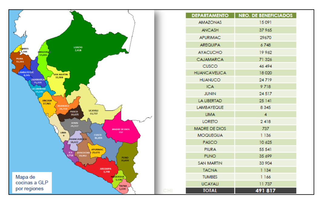
LPG stoves distributed by region

In 2014, the new government set the goal to distribute one million LPG cookstoves in 5 years. The Plan for Universal Access to Energy 2012-2022 considers the implementation of improved cookstoves in areas where there is no market for LPG or natural gas<sup>2</sup>. Until now, the new government has distributed 60,000 additional biomass stoves with chimney and 491.817 LPG stoves and vouchers of 32 soles for purchase of LPG (9.15 dollars at February 15, 2016). MINEM transferred to MIDIS funds for the distribution of 60,000 biomass stoves by 2015.