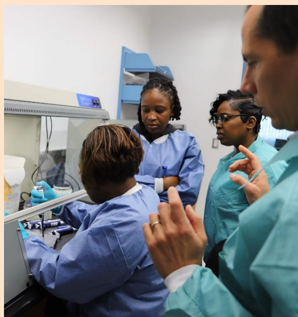
Figure 2: PAHO/WHO trained laboratory technicians of the public health laboratory on SARS-CoV-2 in Bridgetown, Barbados. February 2020