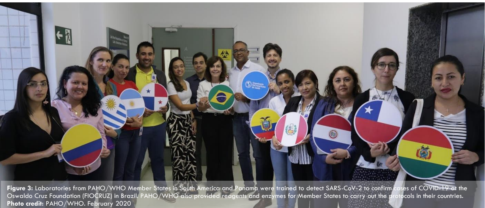
Figure 3: Laboratories from PAHO/WHO Member States in South America and Panama were trained to detect SARS-CoV-2 to confirm cases of COVID-19 at the Oswaldo Cruz Foundation (FIOCRUZ) in Brazil. PAHO/WHO also provided reagents and enzymes for Member States to carry out the protocols in their countries. February 2020

These objectives are expected to be achieved through a combination of activities to support the regional response and activities aiming to scale up individual country readiness and response operations.