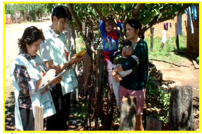
Photo: Health workers verify that a child has been vaccinated during a measles-rubella vaccination campaign, Venezuela 2007

In this campaign, the MMR vaccine will be used to vaccinate children aged 1-4 years, allowing for the monitoring of infrequent adverse events related to this vaccine such as aseptic meningitis.