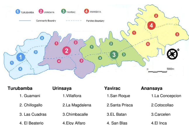
Figure 3 A schematic map of the city of Quito. Footnotes: Names of parishes from where geocoded residential locations of patients that visited the emergency room of the Baca Ortiz Hospital in 2000 correspond to Table 4.

into the lung. The location of the particle's deposition can be influenced by breathing pattern, the branched morphology of the airways, particle size and shape [1]. If a particle lodges in the main airways, it is cleared by the mucociliary escalator [27]. If it penetrates into the non-ciliated alveolar level, it may be cleared by the phagocytic alveolar macrophages. However, in the latter scenario, the particles may impair macrophage-mediated removal and these particles are not cleared. Some particles may directly penetrate the alveolar epithelium and reach the lung's deep lymph node drainage. Macrophages have also been shown to become inundated with inert particles, which subsequently halt the clearance of all particles at the alveolar level [28]. Macrophages release toxins which are utilized to destroy particles; however the released IL-1, IL-6, tumor necrosis factor (TNF), fibroblast growth factor, and the affluence of polymorphonuclear neutrophils damage the host's lung tissue [1]. The short-term effect of the above processes is lung inflammation, which manifests itself as difficulty in breathing and increased susceptibility to respiratory infections. Long-term prognoses include possibly fibrosis and carcinogenesis [29].