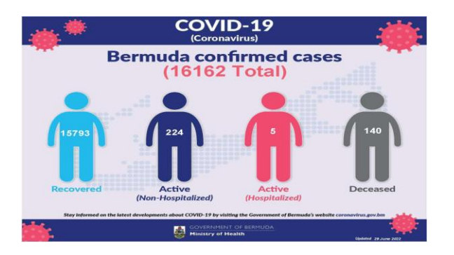
Table 2. Summary as at end of Epidemiological Week 25 (19 – 25 June 2022).

As of 27 June 2022 (reported on 29 June 2022), Bermuda confirmed a total of 16,162 cases of Coronavirus Disease 2019, with 25 new cases within the last 24-hour period. There were 229 active cases (1.4% of total cases), 5 hospitalized cases (2.2% of active cases), with no ICU admissions. New cases have increased by 0.9% during EW 23 , with the total number of deaths increasing by 2 to 140 .