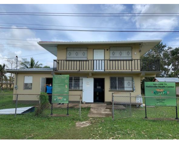
4 Nov. 2022: Assessment of the Hattieville Health Center in Hattieville, Rural Belize District