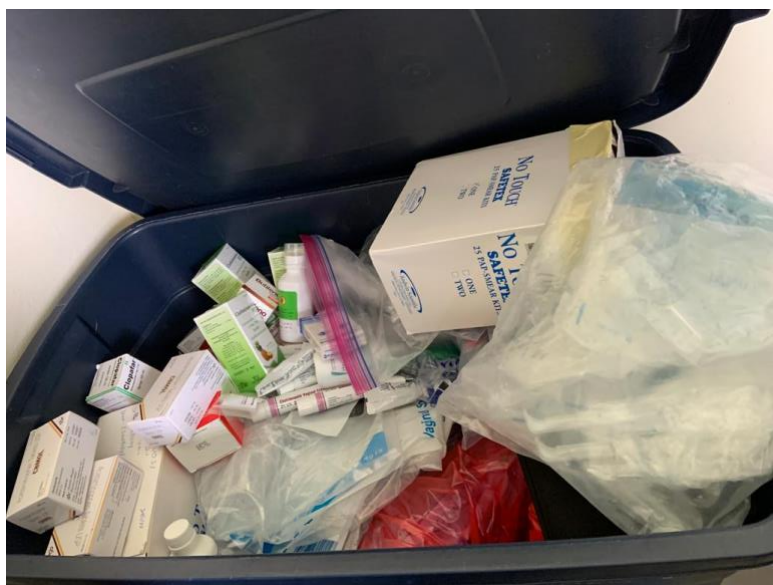
4 Nov. 2022: Review of Hurricane First Aid Kit at Hattieville Health Center, in Hattieville, Rural Belize District