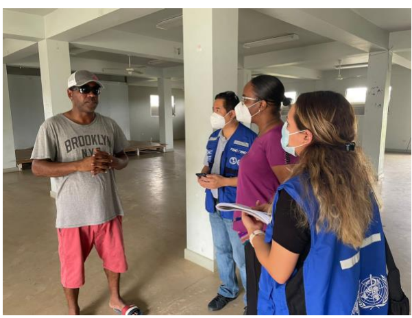
4 Nov. 2022: Meeting with Village Chairman and NEMO Staff at the Hattieville Community Center /hurricane shelter in Hattieville, Rural Belize District