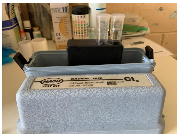
4 Nov. 2022: As part of WASH initiatives, Chlorine tests, reported levels of (0.2) concentration (Reference: (0.5-2.5). Recommendations made to MoHW.