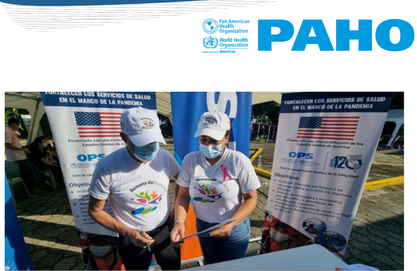
Health fair in San Pedro Sula, the capital of Honduras' Cortés Department, in October 2022.

Honduras's Ministry of Health has deployed vaccination teams to regions prioritized because of their low vaccination rates, including the departments of Gracias a Dios, Colón, Copan, Santa Barbara, Yoro, Lempira, and Atlántida. In addition to vaccinations, the teams provide COVID-19 testing, mental health care, testing of blood glucose levels, and other health services.