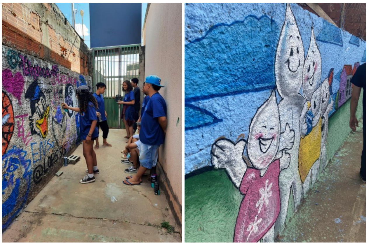
Pro-vaccination graffiti in Estrutural, Brasilia.

The Ministry's COVID-19 vaccination efforts have led to a 11.6% increase in the vaccination coverage rate in Brazil this year. By November 2022, 78.4% of the population had received at least two doses of COVID-19 vaccine compared to 66.8% in January.