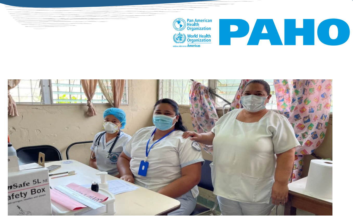
Nurses from the Tela Integrated Hospital in northern Honduras support COVID-19 vaccination in nearby communities.