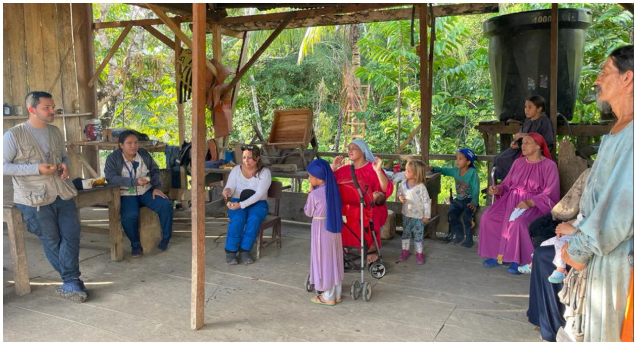
PAHO has supported Colombia's recent efforts to generate more demand for COVID-19 vaccination within the indigenous population in Tarapaca, Amazonas.

During the second half of 2022, the Pan American Health Organization (PAHO) employed U.S. funding to support Latin American and Caribbean countries as they focused on expanding COVID-19 vaccination activities in remote communities where conflict, persistent vaccine hesitancy, and/or lack of access to health services leave them vulnerable to the SARS-CoV-2 virus.