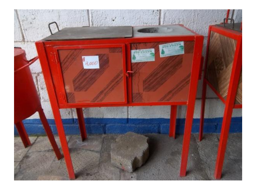
Mi fogón stove

According to data from the National Survey of Firewood Use 2007, 54.5 % of the firewood users collect firewood, 45% buy it, and 1.5 % collects it and purchase. 80 % urban users buy it, and 68.4 % rural users collect it. The Central American Integration System (SICA ) within the framework of the Central Strategy for Sustainable Energy 2020, boost the development of the Regional Program profile with the goal of distributing one million BCS and save at least 10 % of the consumption of firewood in the region by 2020.