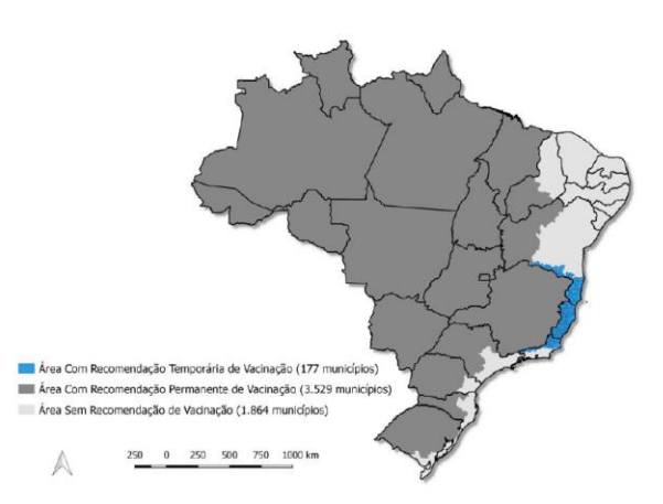
Source: Informe especial febre amarela no Brasil nº 01/2017 , Ministry of Health, Brazil, March 21, 2017.

An emergency meeting of the National Immunization Technical Advisory Group (NITAG) was held on 22 March. After reviewing the available data and subsequent discussions, these were their recommendations: