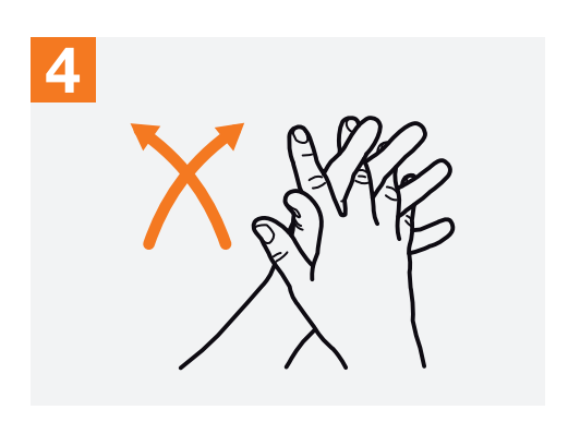
Palm to palm with fingers interlaced;