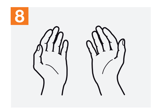
Once dry, your hands are safe.