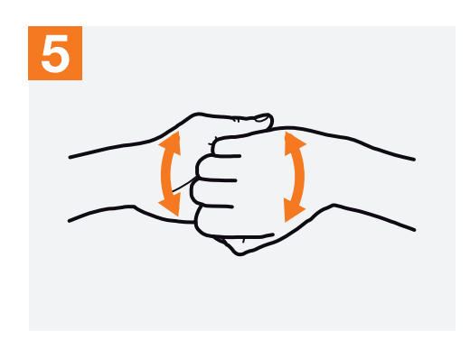
Backs of fingers to opposing palms with fingers interlocked;