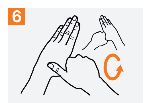
Rotational rubbing of left thumb clasped in right palm and vice versa;