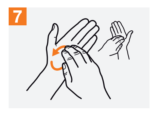
Rotational rubbing, backwards and forwards with clasped fingers of right hand in left palm and vice versa;