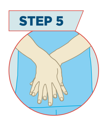
Perform hand hygiene