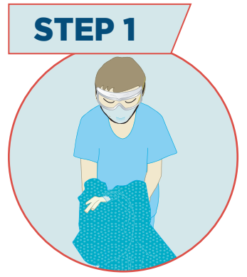
Remove gloves then remove gowns