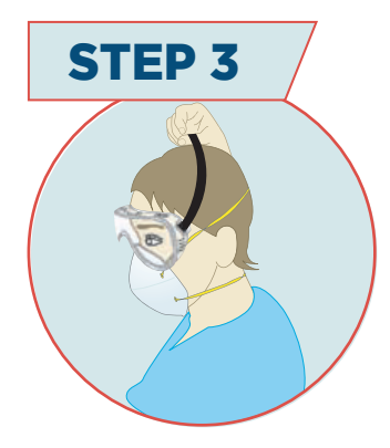
Remove eye or facial protection from behind