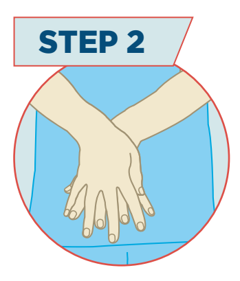
Perform hand hygiene