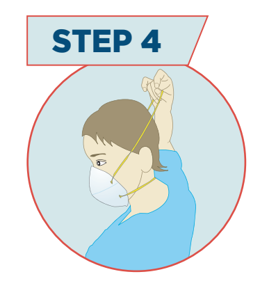
Remove surgical mask or respirator from behind