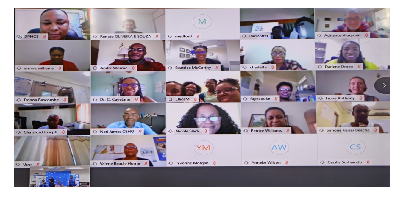
Some of the meeting participants