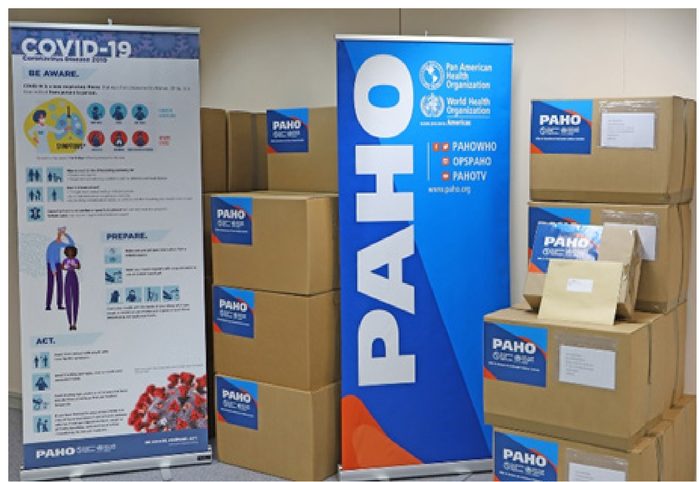
Essential COVID-19 supplies packaged by the PAHO ECC Office for distribution to countries