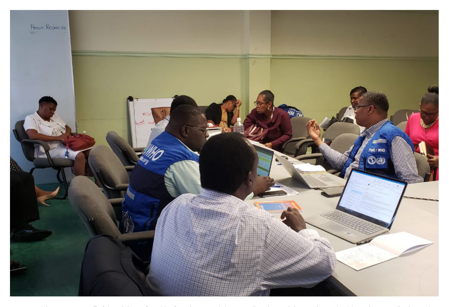
PAHO Advisors engage staff of the Ministry of Health of St. Vincent and the Grenadines in a training session on health services organization and response to COVID-19, IPC and COVID-19 surveillance.

▶ PAHO ECC continued to keep a record of public health and social measures and their changes over time, as well as policies and protocols issued by countries to pave the way to gradual re-opening of the economy and the repatriation of nationals who were stranded in foreign countries with a high rate of COVID-19 transmission.