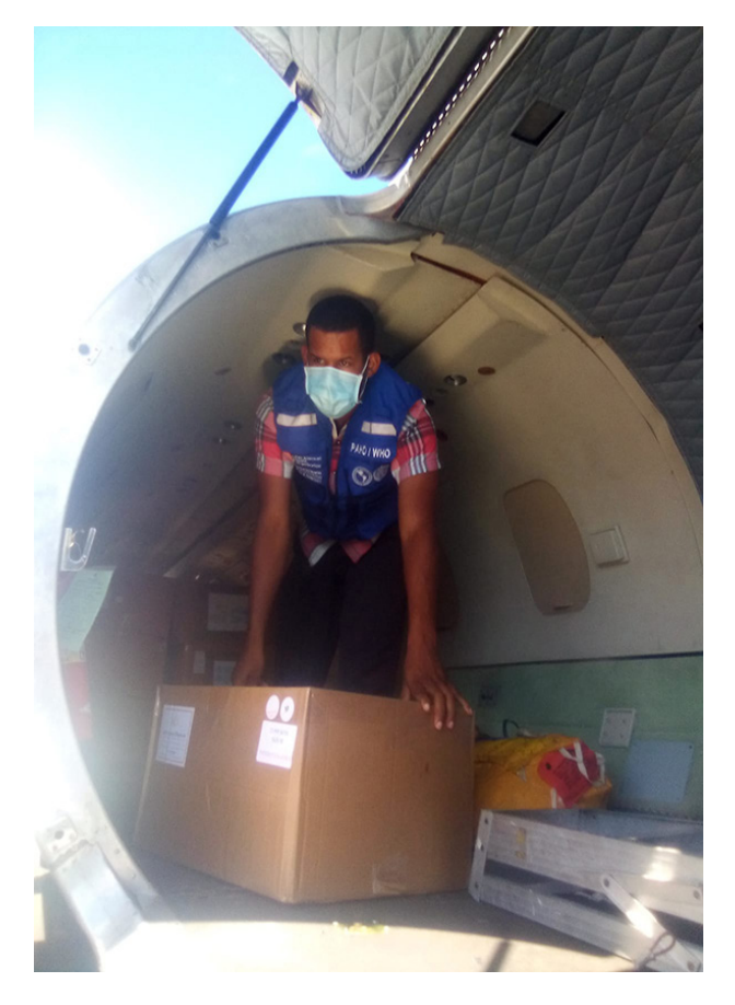
RSS making delivery to Dominica

Due to the challenges of global supply, PAHO has also formalized a relationship with several international vendors to facilitate the procurement of medical supplies and equipment through the PAHO Strategic Fund.