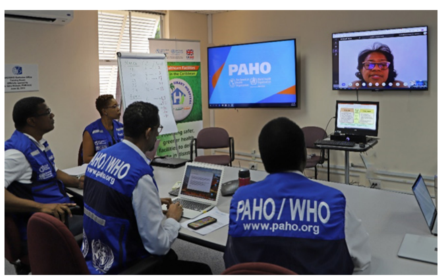
PAHO ECC Incident Management Team Meeting