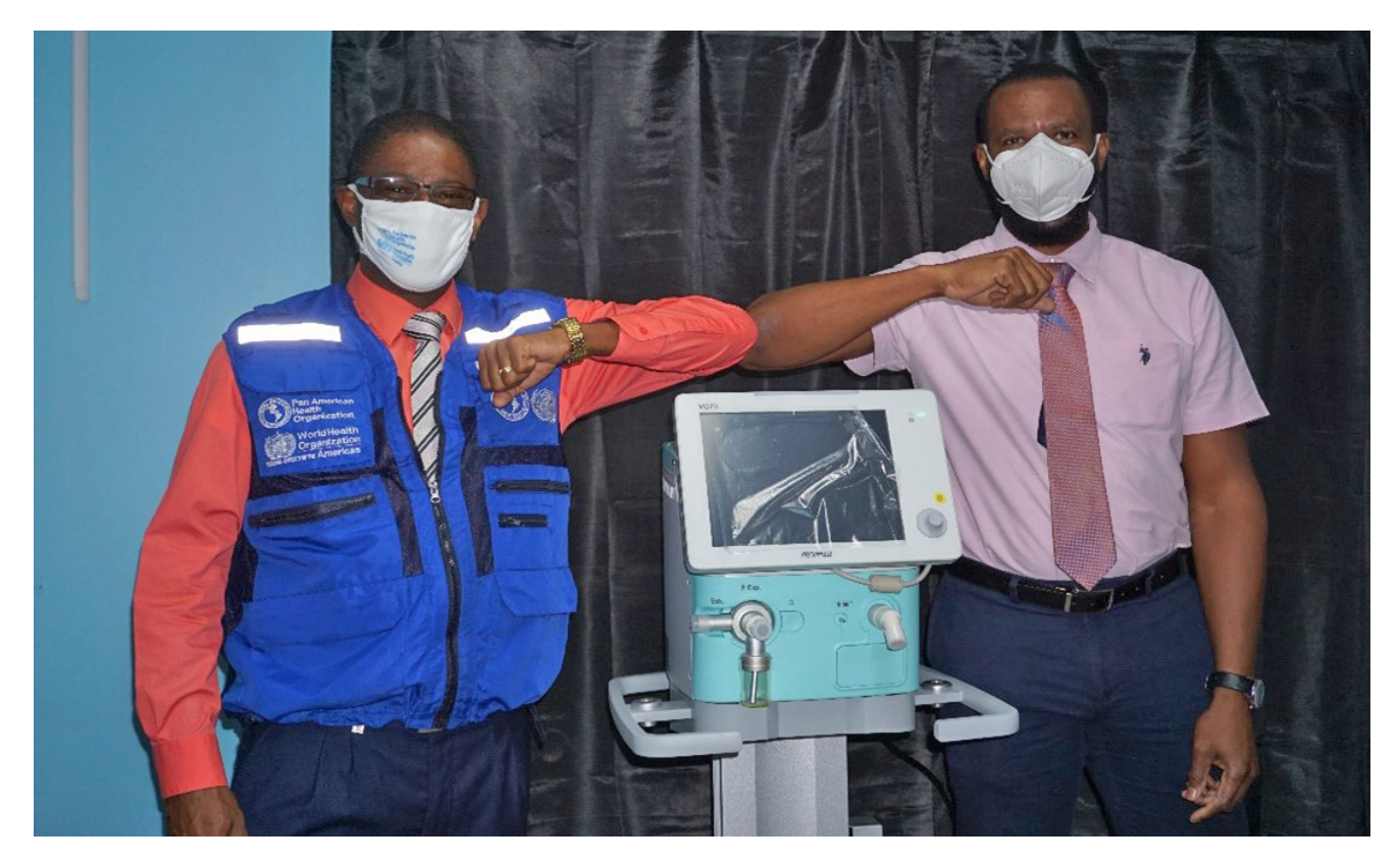
On 22 December 2020, the Government of Saint Lucia received a donation of ventilators from the PAHO/ WHO Office for Barbados and the Eastern Caribbean Countries.

In response to the COVID-19 pandemic, the six ventilators were provided to increase Saint Lucia's capacity to treat patients with respiratory issues. To date, PAHO has donated several essential COVID-19 equipment and supplies to Saint Lucia including, personal protective equipment, oxygen concentrators and laboratory supplies. Training of human resources has also been provided.