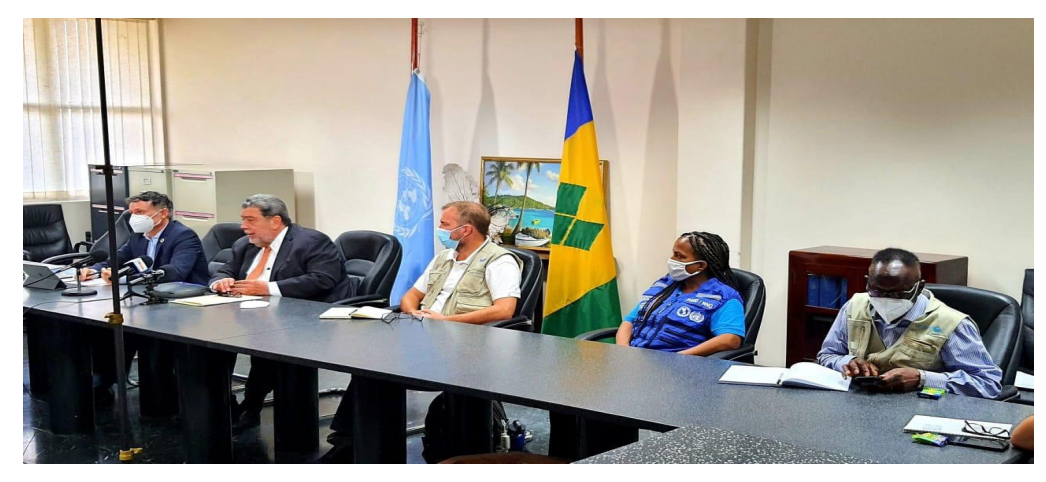
UN Global Flash Appeal