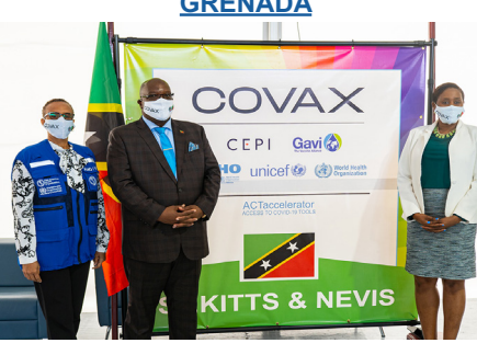
ST. KITTS & NEVIS