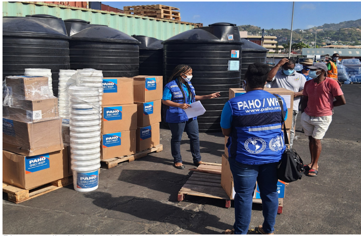
PAHO and MoH Personnel reviewing delivered medical supplies and materials, supplied by PAHO according to the MoH needs list (see annex).