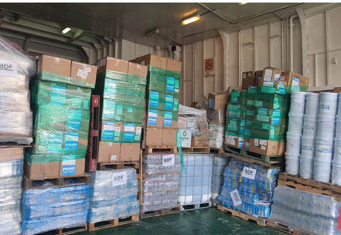
Medical supplies and materials, supplied by PAHO according to the MoH needs list (see annex), arrived in VCT 24 April 2021.