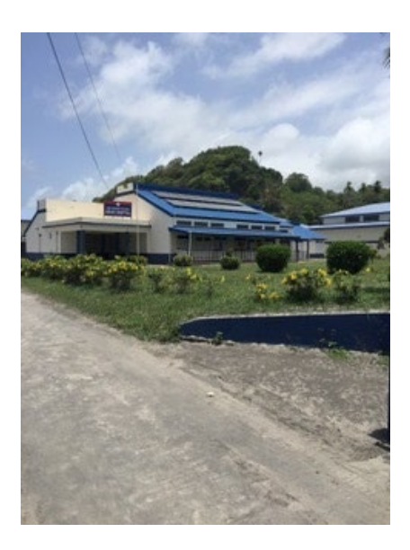
Overland Health Centre