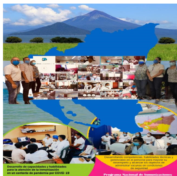
Photos of pre-pandemic EPI vaccine management trainings in Nicaragua.

In order to maintain this achievement, an EVM course was conducted virtually for the first time, considering limitations from the pandemic. A combined methodology was used. Prior to the virtual meeting, participants read the criteria to be evaluated. Pre and post tests were carried out to confirm the knowledge acquired. Participants scored correct answers between 70 and 90% when comparing the results of the pre-tests and post-tests. This confirms an improvement in the knowledge of the evaluation criteria, as well as in the management of key components of the cold and supply chain, such as the adequate preparation of ice water packs, distribution, among other components.