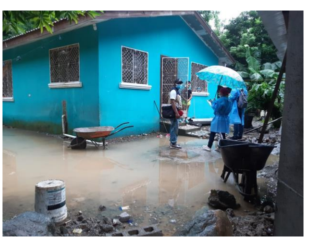
Figure 2: Honduras