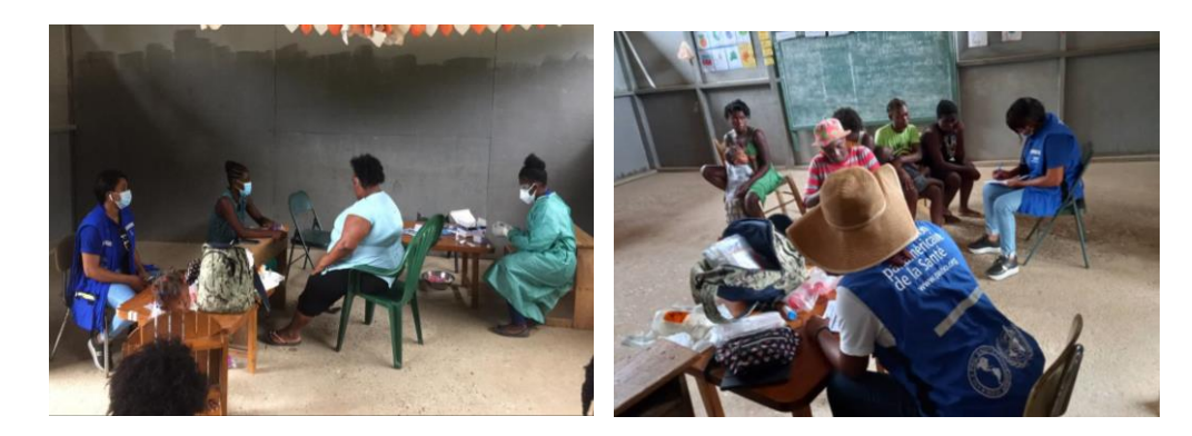
PAHO/WHO and mobile health clinic carrying out COVID-19 testing in Grand'Anse Department