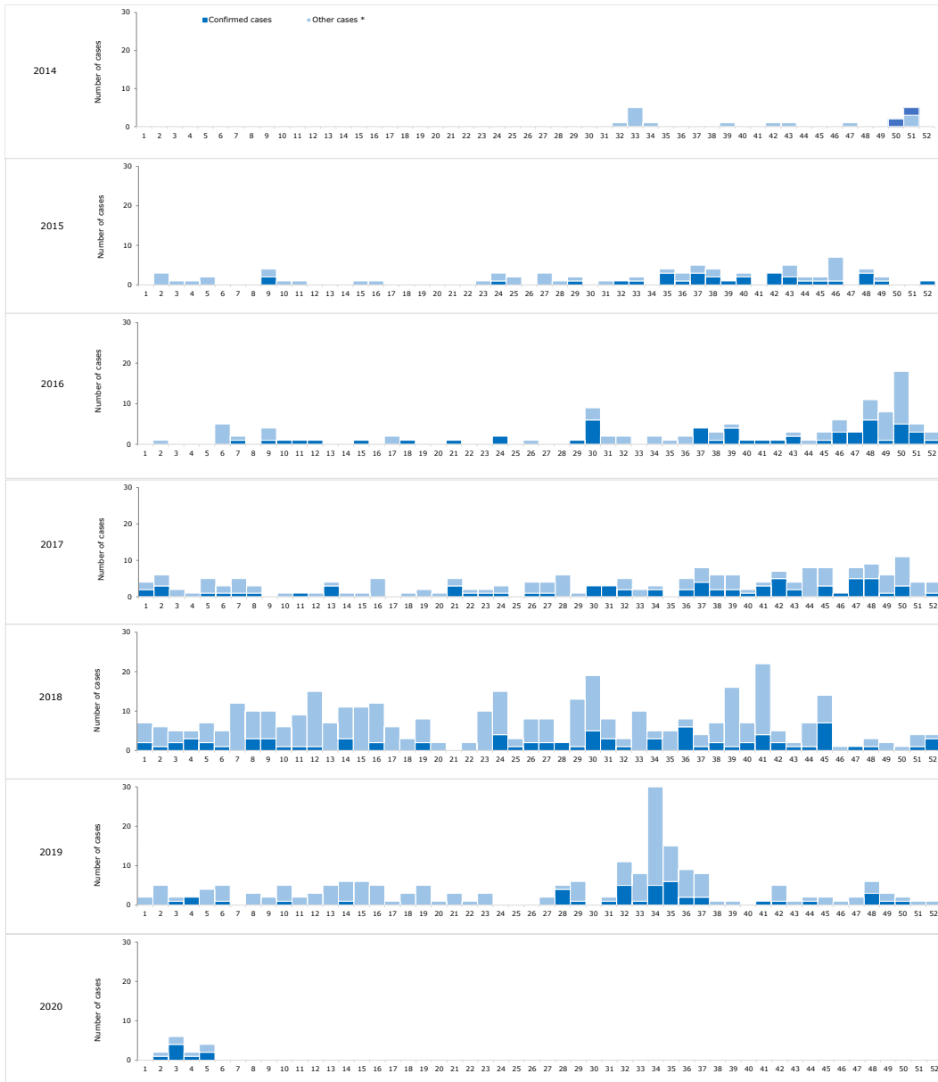
Figure 1. Distribution of reported diphtheria cases by epidemiological week of symptom onset, Haiti, EW 32 of 2014 to EW 17 of 2020.

*Other cases refer to all cases with negative laboratory results, those for which test results are pending, or those for which viable samples were not available.