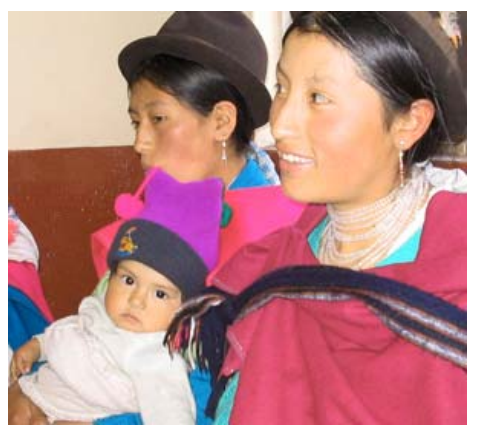
Indigenous mothers and child waiting at a public health center in Ecuador

The Ministry of Public Health (MPH) of Ecuador identified the challenges for strengthening health system performance in that country namely, lack of leadership, institutional segmentation, fragmentation of services, inadequate model of care, limited state investment in health, insufficient management capacity, inadequate coverage, and low quality of care. As a result, 27% of the population does not have access to care, the public coverage only reaches 49% of the population, and 44.3% of the health expenditure comes directly from households and is higher among poorer sectors of the population, which spend nearly 10% of its annual income on health.