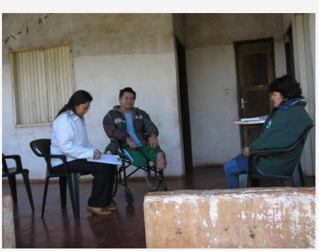
hemorrhage receives a health team at home.

USAID and PAHO/CLAP-WR have supported the Ministry of Health of Paraguay in developing A husband who lost his wife due to a post-abortion RAMOS (Reproductive Age Mortality Survey) methodology in three important regions: Alto Paraná, Central Region and Asunción (including the capital city). With the technical support of CDC and the commitment of the Ministry of Health all deaths of women of