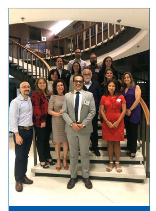
Participants at the meeting of the Maternal and Neonatal Immunization Group in Washington, D.C., September 2018.

MNI refers to vaccines administered before pregnancy, during pregnancy, and during the puerperium for the purpose of immunizing both mother and child. This is fundamental, since newborns and infants during the first months of life are particularly vulnerable to infections from vaccine-preventable diseases. Furthermore, their immature immune system is not yet capable of producing a protective immune response to specific antigens in different vaccines until several weeks or months after birth.