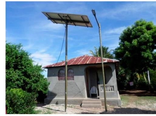
Solar panels.

open access journal PLOS Neglected Tropical Diseases. Due to Haiti's recent history and PAHO's goal to "eliminate dogmediated rabies in the American region by 2015", a mission was started in 2013 to assess the capabilities and impact of rabies surveillance and control programs in Haiti utilizing technical support by PAHO and resource support from Brazil in controlling this endemic disease. The study also assessed coordinating efforts from national and international partners such as the Ministry of Agriculture and Ministry of Public Health and Population in Haiti, Centers for Disease Control and Prevention (CDC). This article is a crucial step in evaluating the