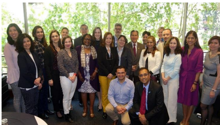
Participants of the Second Meeting of Experts to Review the Regional Guide on ESAVI Surveillance in Santiago, Chile.

The regional manual is based on the WHO global manual published in 2014, evidence from reviews of the scientific literature and results from visits to specific countries (Chile, Colombia, the Dominican Republic, and Mexico), where in-depth interviews were conducted with experts, focusing also on identifying and understanding the flow of reporting and research of an ESAVI from the local to national levels.