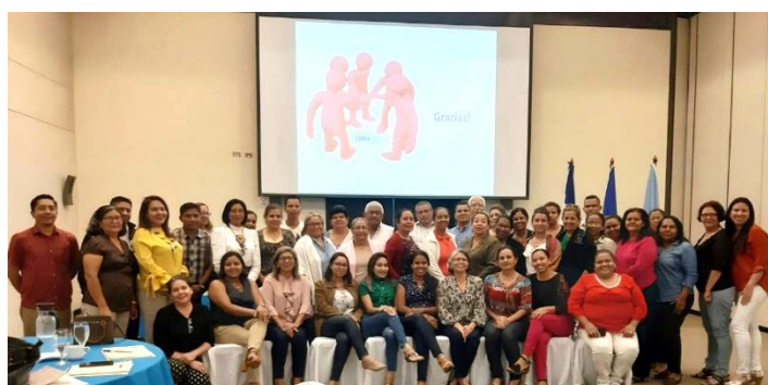
Participants at workshop on rapid responses to imported cases of measles, rubella, and congenital rubella syndrome, September 2019.

Analyzing the current epidemiological situation of measles in the Region of the Americas and the world, where measles outbreaks have occurred, the country has decided with help from international experts and PAHO/WHO, to train local teams in preventive actions that allow a timely and effective response to the possibility of imported measles cases, as established by the Regional Monitoring and Re-verification Commission (RVC) for Measles and Rubella Elimination.