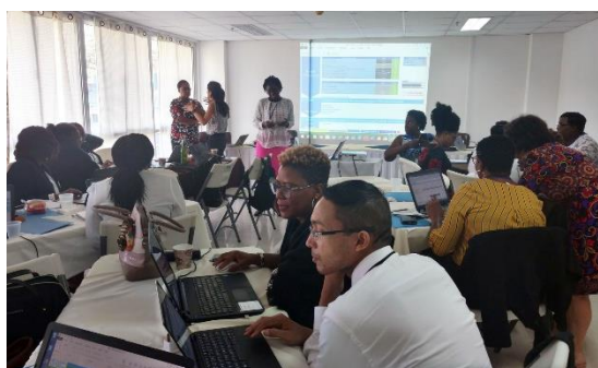
Participants at workshop on data use for measles and rubella elimination, Grenada, October 2019.

The use of the tool by the workshop participants provided valuable feedback to improve and release the final version of the tool, including the country report template and user guide.