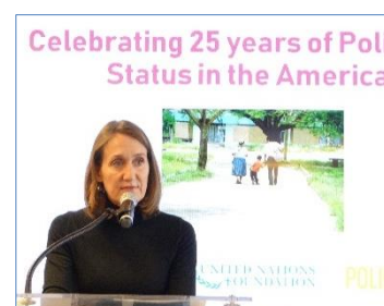
Amb. Elizabeth Cousens, UNF.

UNF's Deputy CEO, Ambassador Elizabeth Cousens, opened the ceremony, congratulating PAHO and all the countries of the Americas for maintaining polio-free status for more than a quarter of a century and stated: "The UN Foundation is proud to work with all partners to support the Global Polio Eradication Initiative. We will continue to advocate for the polio resources needed until the job is done, and no child will ever have to fear polio again."