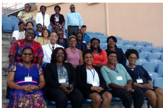
Participants at workshop on data use for measles and rubella elimination, Grenada, October 2019.

Overall, the results showcased the need for complete and accurate coverage and surveillance data, as well as the importance of enforcing surveillance activities through the implementation of active case finding especially in the context of on-going arbovirus infections, such as dengue fever, which also presents with fever and a rash. The importance of performing an analysis of population immunity by cohorts at the district level, to more accurately determine the susceptible population in need of supplementary vaccination activities was also appreciated. This is especially important since the Caribbean countries do not conduct follow-up campaigns but administer and record individual delayed doses with the MMR vaccine every month at the health facility level, given their small target population size. Thus, population immunity levels may be higher than the reported annual routine coverage during the last five years.