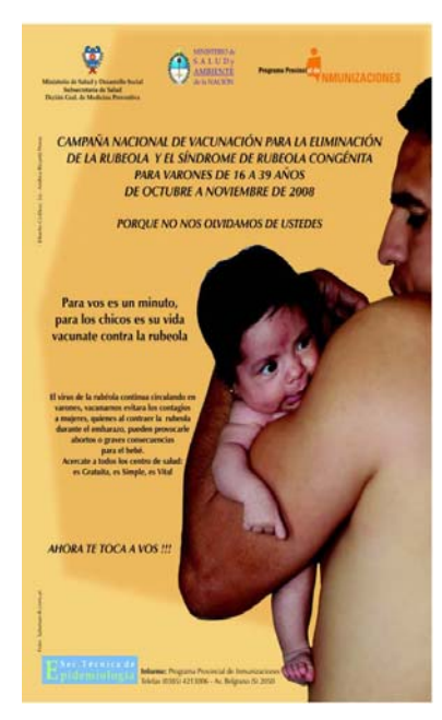
Poster –Santiago del Estero Province