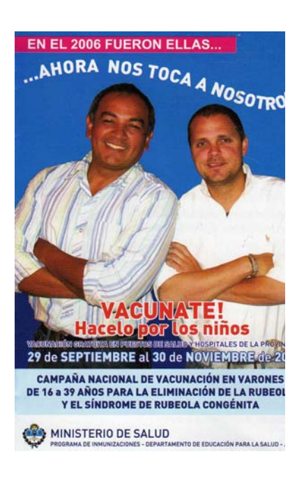
Poster - Jujuy Province