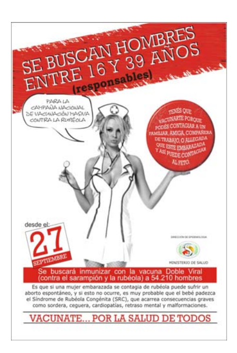
Poster - La Rioja Province