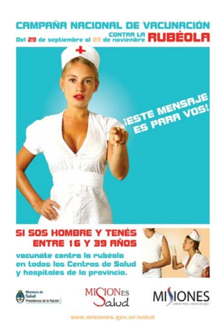
Poster- Misiones Province