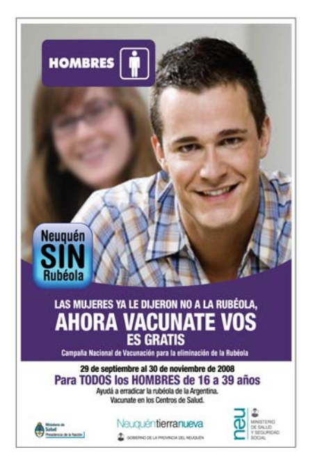
Poster- Neuquén Province