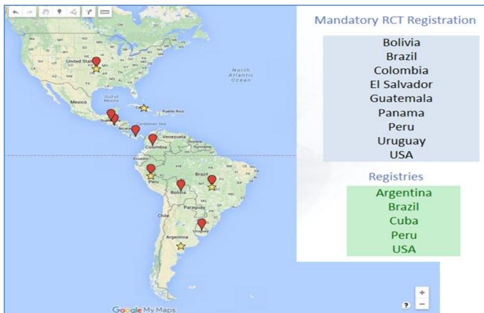
Figure 5. Geographical Depiction of RCT Registries and Mandated Registration

Though volume can indicate an increase in research for health, steps must be taken to ensure it is impactful, of high-quality, ethical, and done responsibly. ACHR/CAIS proposed the updating of PAHO's Ethic Review Committee (PAHOERC) and integrated in its works issues such as research registration and other tools to protect human and animal subjects, increase the value of research, and reduce waste of already limited resources. Through a specific committee, ACHR/CAIS has also advocated for the enhancement of the guideline development processes ensuring that research evidence and proper standards were used in the development of guidelines and recommendations, and the process was aligned and integrated with WHO's Guideline Development Process and