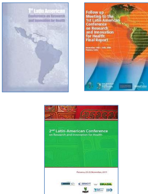
Figure 4. Cover of the Reports of the Latin American Conferences on Research on Health and Innovation for Health

ACHR/CAIS maintains that PAHO must build and strengthen these external and internal strategic collaborations, in order to