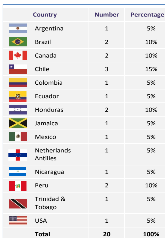
Figure 3. ACHR/CAIS Members Since 2009

The Policy on Research for Health seeks to improve public health through the strengthening of National Health Research Systems (NHRS) and the development of sustainable capacities to seize the benefits of research, producing and using research to its potential throughout the Americas.