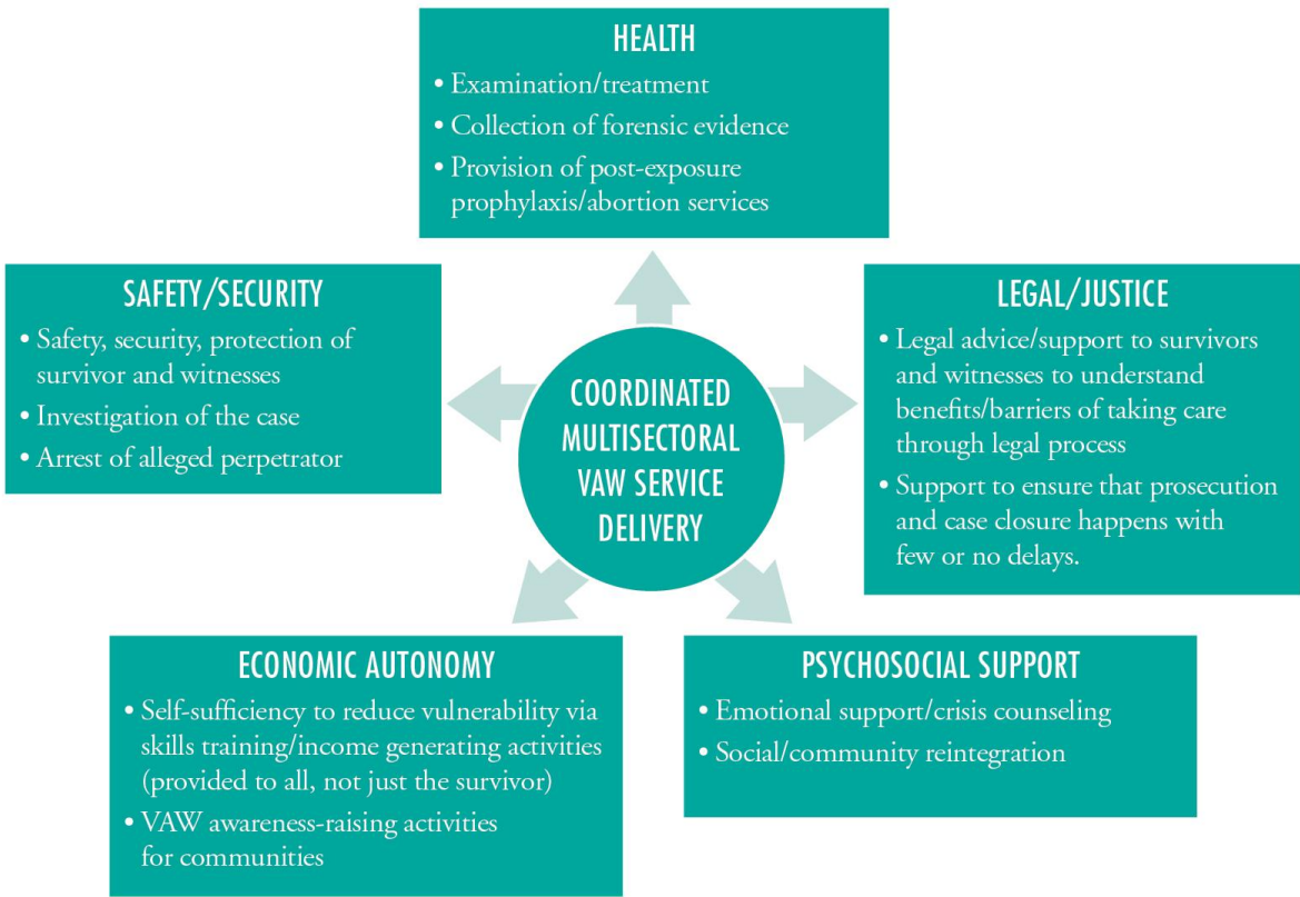
Figure 2. Services for VAWG survivors by sector

Adapted from UNFPA, Building Survivor Centered Response Services: Participant Manual. Pakistan, November 2010.