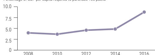
Percentage of GDP per capita required to purchase 100 packs